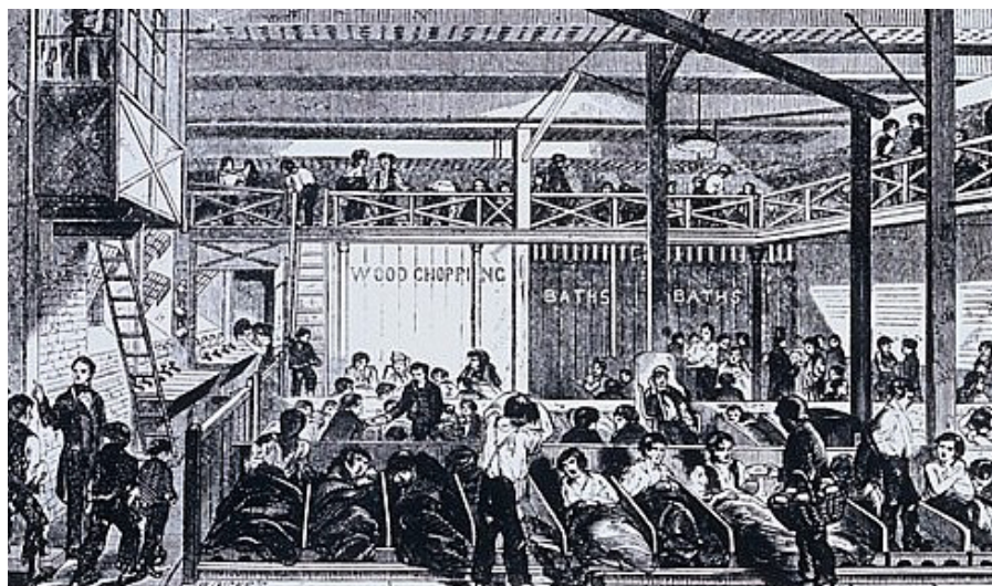
The Field Lane Male Refuge

premises was converted into a dormitory and on 30 th April 1851, the Field Lane Night Refuge was opened into which these men and boys could be admitted. There was sleeping accommodation