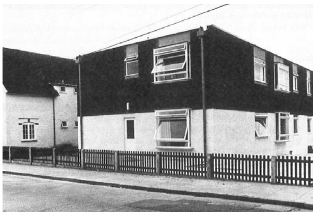
The new extension at Singholm

By far the largest project in this process of development related to Singholm in Walton-on-Naze. This home, which was built in 1910 as a holiday home for younger and physically active people, had been transferred to Field Lane in 1953 and adapted for use as a residential home. It had become apparent that, despite various miscellaneous improvements, including the installation of a lift in 1963, the premises were not fit for purpose for use by the far more infirm people seeking admission. There were plans prepared which involved the extension of the main building so that forty two residents could be accommodated in single rooms. The kitchen