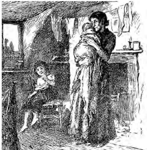
One of the homes