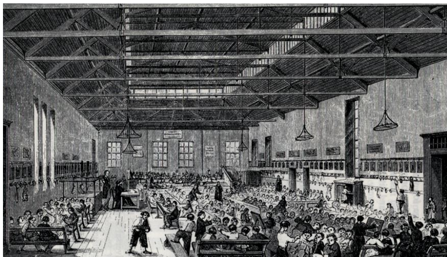
Field Lane School room

As one door of educational service began to close another opened. In 1871 two Certified Industrial Schools were started, one for boys and another for girls. These residential schools were designed to educate and train orphans, destitute and deserted children. The