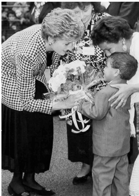
Diana, Princess of Wales visiting the Homeless Families Centre

The centre's special regard was demonstrated by the visit of the then Prime Minister Tony Blair and the launch with Comic Relief of the Domestic Violence Helpline in 2003 with well known celebrities attending. Diana Princess of Wales also visited and spent time with the families. Of great interest was the visit of the Director of Homelessness for the United States government to see the centre in operation and meet the families. The BBC featured the centre in a World Service programme and Sky news also ran a programme. In 2003 a second centre was opened near King's Cross in partnership with a local church with substantial government funding.