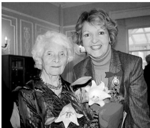
Penelope Keith visiting The Priory

The homes were adapted to reflect a more dynamic approach to dementia support with, for example, domestic style kitchens installed for the use of residents with their families.