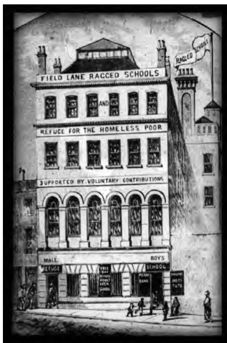
The Field Lane building opened in 1866

The wisdom of this was shortly revealed when it was discovered that the construction of an approach road to the new Smithfield market would involve the demolition of the school's premises. It was decided that new buildings should be specially designed to accommodate all the activities undertaken