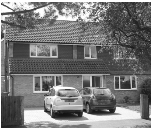
Salfords, near Redhill

A positive outcome of the country's financial crisis was that property suitable for learning disability projects was very affordable and local authorities had money for fees and charges when supported living was an alternative to residential care. A successful application was made to Futurebuilders and two houses were acquired and adapted; Salfords near