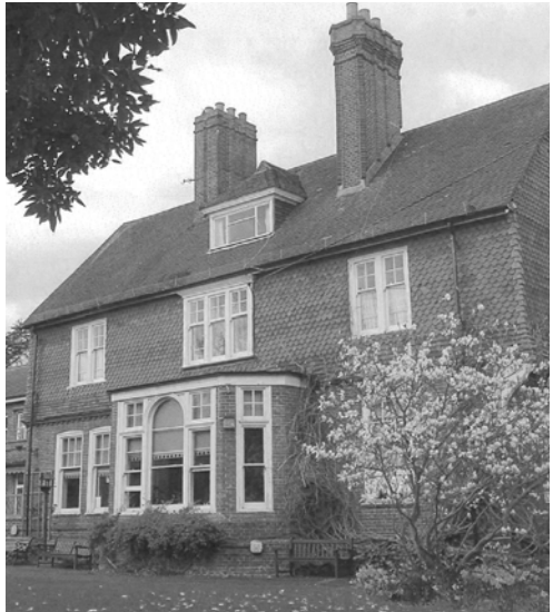
The Priory, Worthing

Field Lane was now firmly established in its work with older people with four care homes, a day centre and one home for older people with a disability. The homes were set in good locations across the South East from Walton on the Naze through Southend to Reigate and Worthing. They all had fine grounds and interesting but old buildings which was also true of the day centre. The day centre was near to the offices in Vine Hill at Cubitt Street; the Havens Guild for older people with a disability was in Barnet. All the services had a good reputation and offered what Field Lane set out to achieve - places of welcome and comfort for the increasing numbers of older people who needed care in their final years.