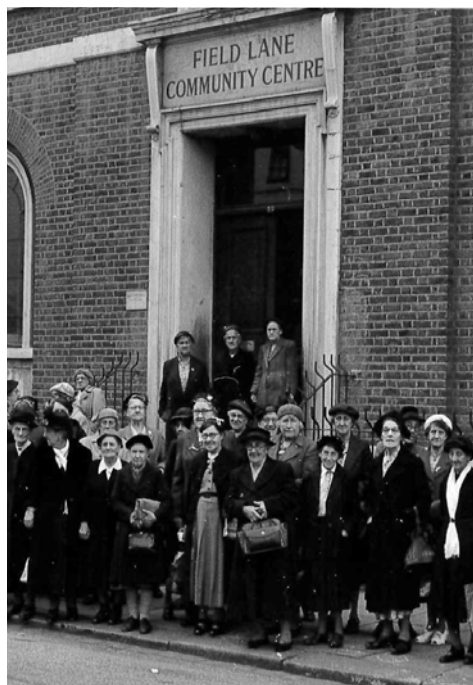
The Community Centre

year lease for a derelict, war-damaged chapel – Ampton Street Baptist Church, near King's Cross – was secured, the premises rebuilt and re-opened in 1952 as a new centre bearing the name "Field Lane Community Centre". Here Field Lane's earlier work was continued although, once again, it was found that the greatest social need was among the elderly. Most activities, clubs, meetings, a meal service, visitation, and so on became orientated to the needs of older people.