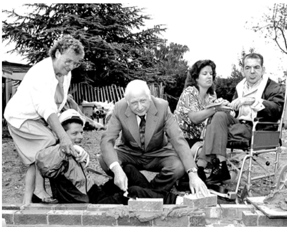
Badgers Construction Ceremony in 1992

Field Lane had been approached by the health authority in the Southend area to see if a new registered nursing residential centre for nine people with severe learning and physical disabilities could be built in the grounds of Eastwood Lodge. The residents would be coming from South Ockendon hospital which was to be closed as part of the Government policy to move people from long stay hospitals to community located care. Field Lane would have total responsibility for the building and the care of the residents for an agreed annual fee. This was agreed and Badgers opened in 1993.