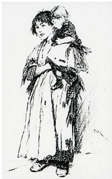
One of the Ragged School scholars

In addition to the Day School, other activities were being explored. Six years after the small beginnings in Caroline Court, the regular meetings held included: Monday evening – Parents' Meeting;