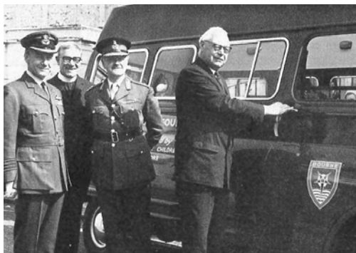
The "Bourne School" Ambulance