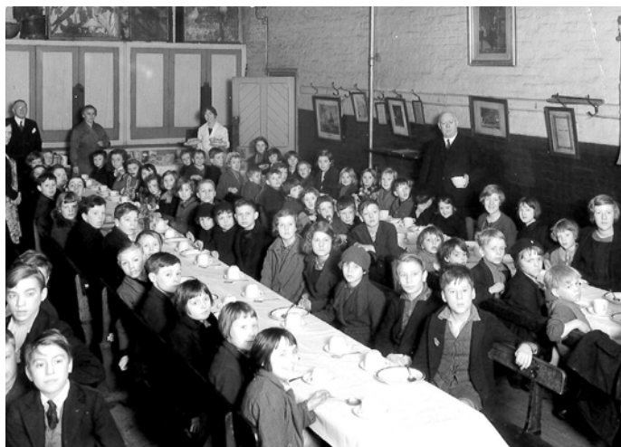
Children's Party, 1936

of Certified Schools, including the Field Lane School at Hampstead. The building was sold and part of the proceeds used to buy some land adjoining the Vine Hill premises in order to provide a children's playground. It was hoped that eventually this land could be used to enlarge the premises, but before any plans could be formulated Germany invaded Poland and Europe was once again plunged into war.