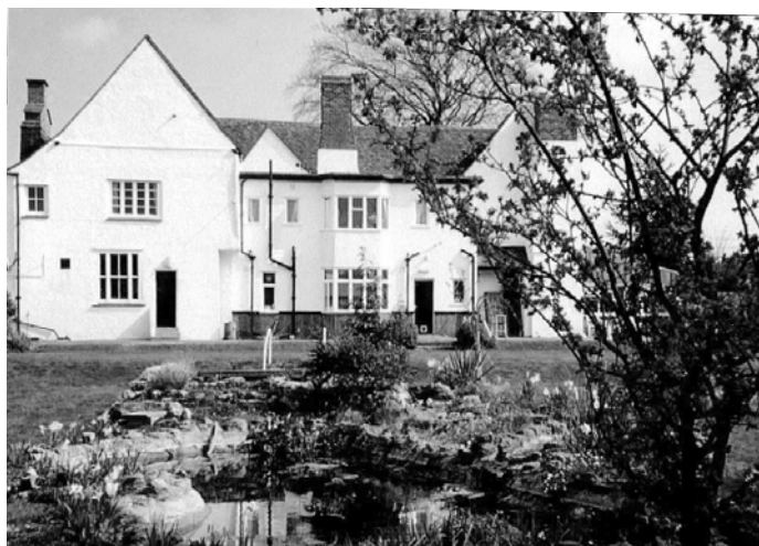
Eastwood Lodge, Essex

In 1946 also, Eastwood Lodge, empty and neglected since 1939, was put in order and opened to provide holidays, the bungalow being used for children but the house being reserved for elderly people.