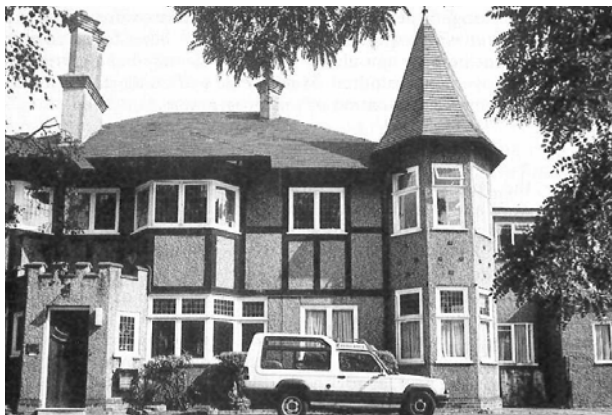
The Havens Guild